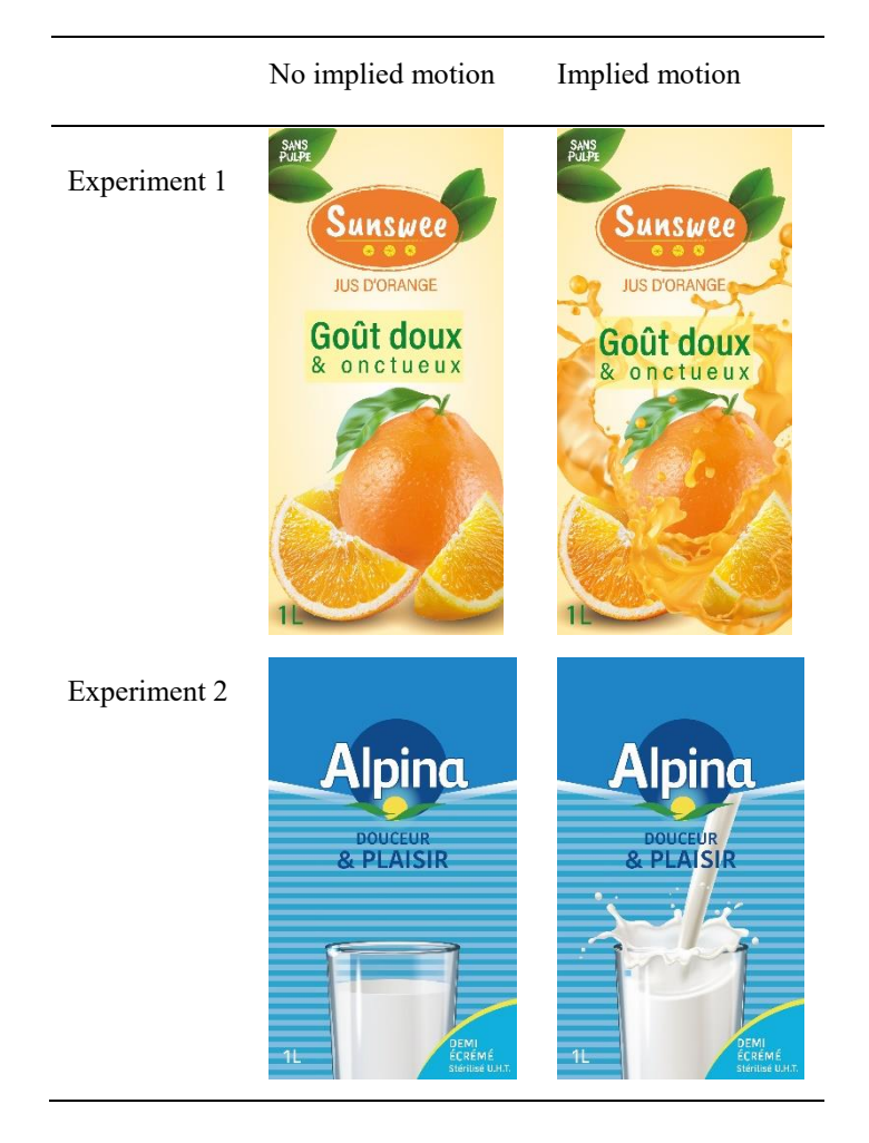
Figure 2. Target stimuli used in the experiments