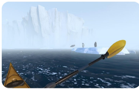
Screen capture of the virtual environment