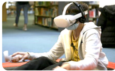
Participant seated in the kayak