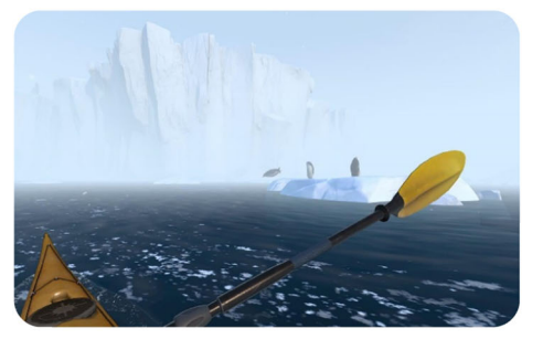
Screen capture of the virtual environment