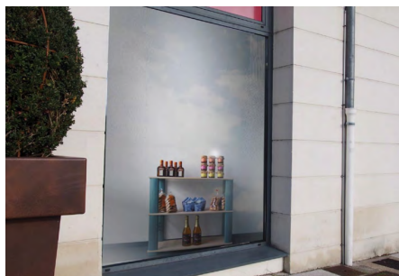
Figure 3: Window display (abstract construal level)