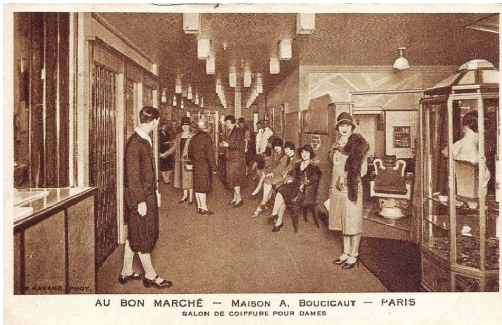
Figure 4. A postcard of a Women’s hair salon at Le Bon Marché in 1932 as a marker of the gendered heterotopia.

by Parisian stores” (Crossick, Jaumain, 2018, p. 17), in the 1880s women made up around 90% of their customers (Whitaker, 2011).