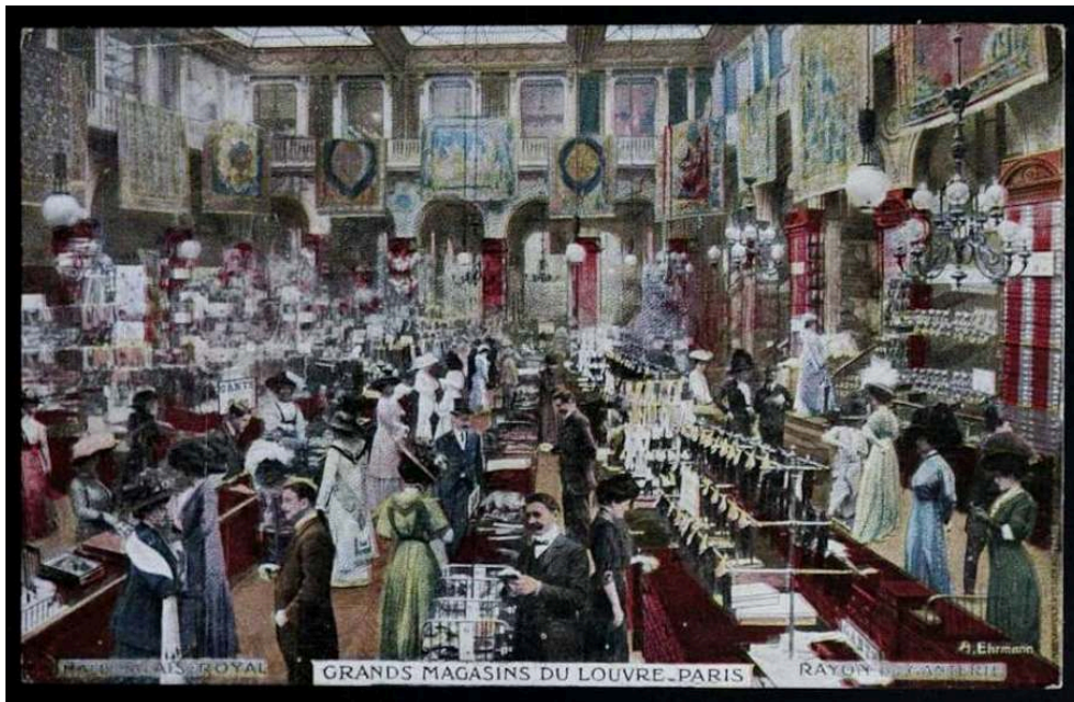
Figure 3. A postcard of Les Grands Magasins du Louvre around 1910: the oriental carpets hung on the walls transformed into “phantasmagorias”.