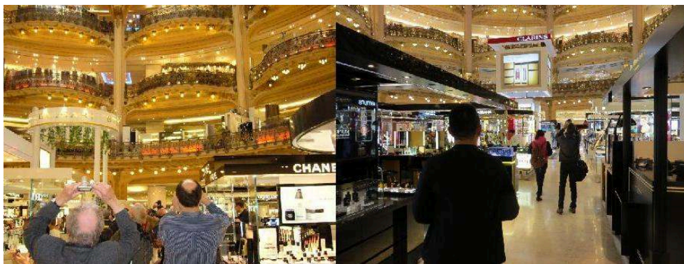
Figure 5. Visitors taking photographs of the dome in the atrium at Les Galeries Lafayette Haussmann.