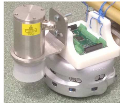
Figure 3: Khepera robot equipped with a Laser pyrometer

On this same surface several mobile robots will be equipped with pyrometers laser (figure 3) to measure the temperature of the plate on a small area (a few mm 2 ). Their locations and the measured temperature will be transmitted to a central computer via a wireless (WIFI) technology.