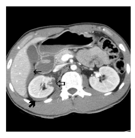
Figure 3. Clinically unsuspected renal injury (original prescribing intent: no abdominal scan): axial slice of abdomen in abdominal window, in portal phase, showing a fracture of the posterior lip of the right kidney (hollow arrow), associated with a right perirenal hematoma (short solid arrow) and peritoneal effusion (long solid arrow).

sustained trauma whose mechanism or violence suggests that such lesions may exist. Time to treatment of trauma patients is one of the main factors in preventable deaths of multiple trauma victims [13,14] and negatively correlates with patient survival [15,16]. At the same time, 12% of patient deaths due multiple traumas were preventable, either because justification for surgery was not established or because injuries went unnoticed on the clinical examination [17,18]. Numerous studies have shown that WBS should be the preferred method of exploring severe trauma [2–11]. However, the clinical examination can sometimes be insufficient to justify such a study [19] or the benefit of using probabilistic criteria, such as the Vittel criteria, for the presence of severe trauma.