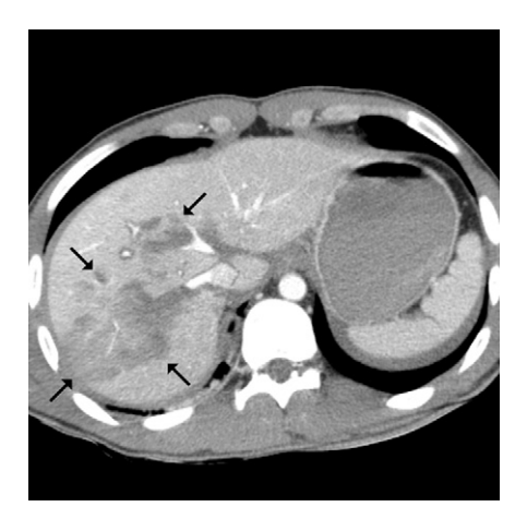
Figure 4. Clinically unsuspected hepatic injuries (original prescribing intent: no abdominal scan): axial slice of abdomen in abdominal window, in portal phase, showing hypodense lesions of hepatic segments VII and VIII, corresponding to multiple hepatic fractures of the right lobe (arrows).

In our study, 15% of 164 patients for whom the Vittel criteria led to performance of a WBS had unsuspected severe injuries. These results confirm our initial hypothesis, i.e., the benefit of using the Vittel criteria to determine