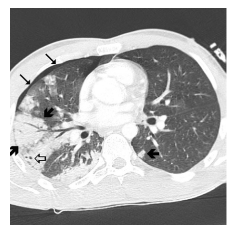
Figure 5. Clinically unsuspected pulmonary injuries (original prescribing intent: no scan): axial slice of chest in parenchymal window showing right anterior pleural detachment corresponding to a right pneumothorax (long solid arrows), pulmonary condensation at site of air bronchograms corresponding to pulmonary contusions (short solid arrows), and subpleural air cysts corresponding to pneumatoceles (hollow arrow).

the need for a WBS in a severe trauma patient. However, this increased effectiveness is associated with a significant increase in the number of WBS performed, as well as an increase in the proportion of normal WBS. This has three implications: