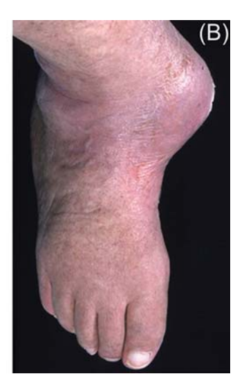
Figure 1. Example of a severely deformed Charcot foot. (A) Ankle X-ray and (B) ankle deformity.