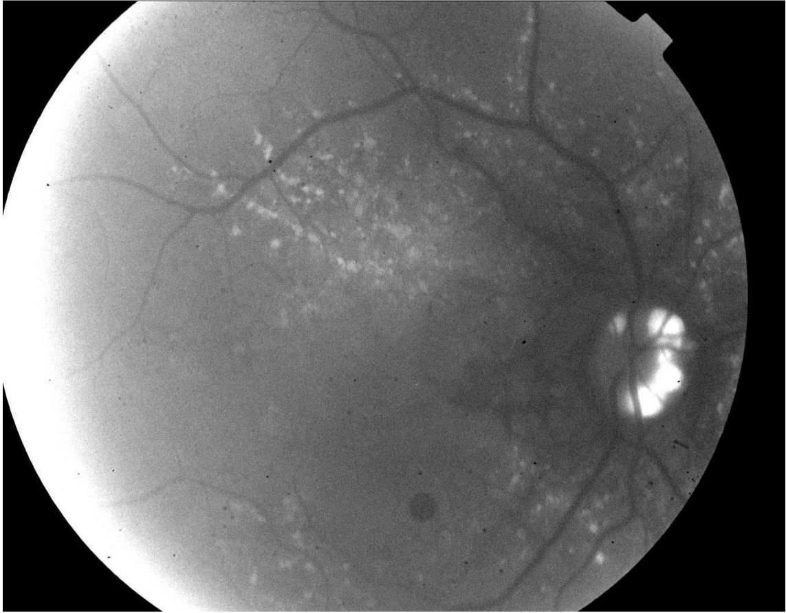
Figure 2: stage 2 drusen